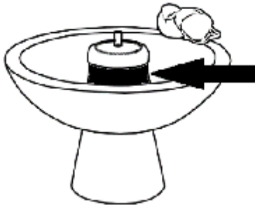
FT-255A (6 lbs) 7.75"W x 4.5" H